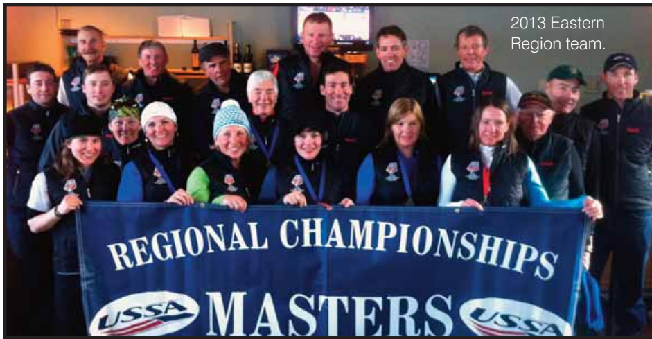
2013 Eastern Region team.

After the President's Day weekend off, the schedule moved on to several of the most popular SLs of the Series. The oldest continuously-run ski race in North America (but for a year off during WWII), the Hochgebirge Challenge Cup at Cannon boasted the largest SL field of the season and included a number of new faces. The race was followed, as always, by the traditional party at the house of one of the oldest ski clubs in North America, the