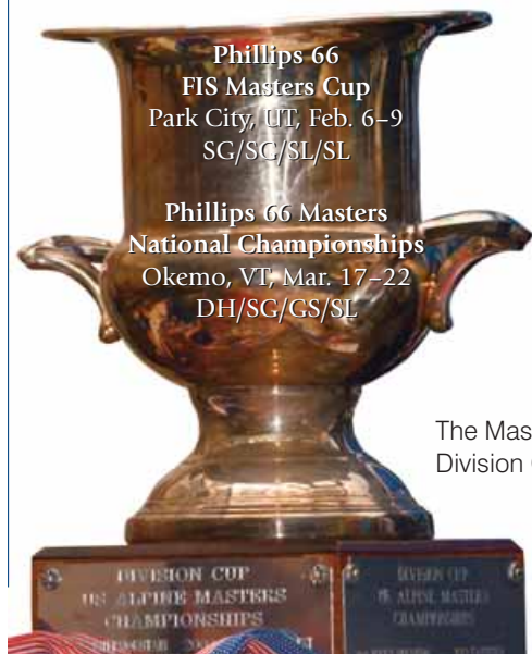
The Masters Division Cup

Phillips 66 Masters National Championships Okemo, VT, Mar. 17-22 DH/SG/GS/SL