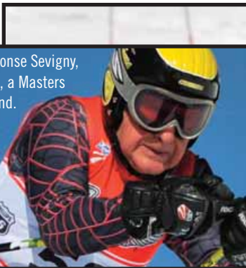
Alphonse Sevigny, East, a Masters legend.