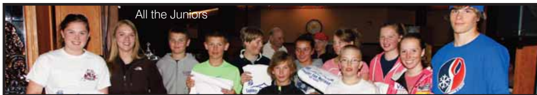
All the Juniors

for the under-60 men's class. Other PNSA racers are also sporting the special Molecule F belt buckle. See full results at ussamasters.org/reports/2013/nss/ES-NSS2013-WCPoints-By-Class.html