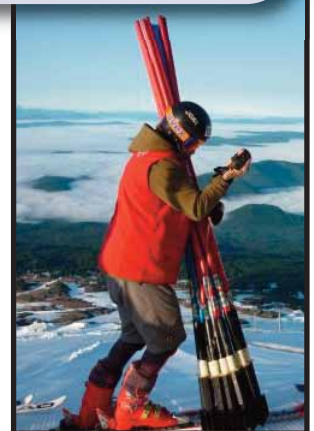
Course setting at o'dark thirty am.

Nationals at Mt Hood, 3rd weekend in July, and in the gates at a race or training group this summer or next fall. Schedules will be posted at www.pnsamasters.org and www.skiracereg.com . We welcome all levels of racers—take the challenge in the gates with new friends!