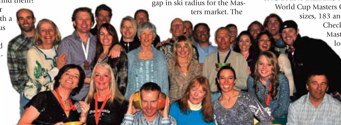
The Intermountain Masters

Check out the Fischer Masters GS skis at your local Fischer retailer or Jans/Rennstall.