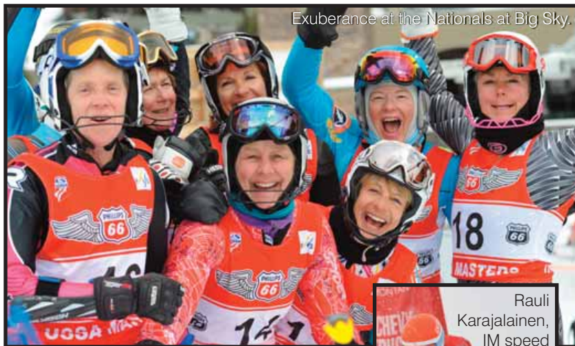
Exuberance at the Nationals at Big Sky.

After enjoying a snowy and cold holiday break, we resumed racing in January with the Viva Italia! SLs at Heavenly Valley on a Friday. The Viva Italia Cup is sponsored by John Giannotti and is awarded to the top male and female racers in the first race, utilizing an age handicapping formula. The 2013 Viva Italia winners were