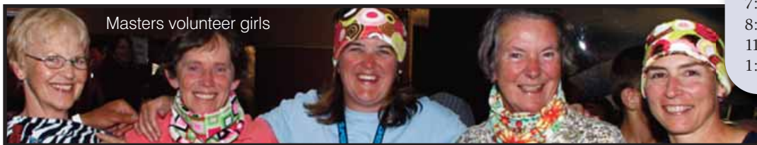
Masters volunteer girls